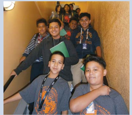
Alief ISD students touring the Ocean Star .