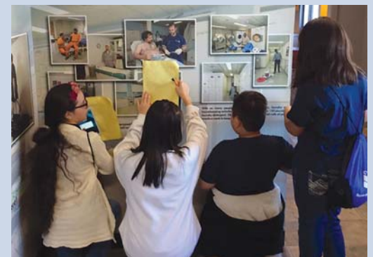
Students finding answers to their homework questions.