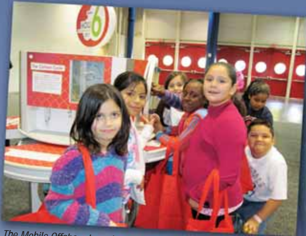
The Mobile Offshore Learning Unit (MOLU) has become very popular among teachers and students alike. Read more about this education outreach program on page 7.