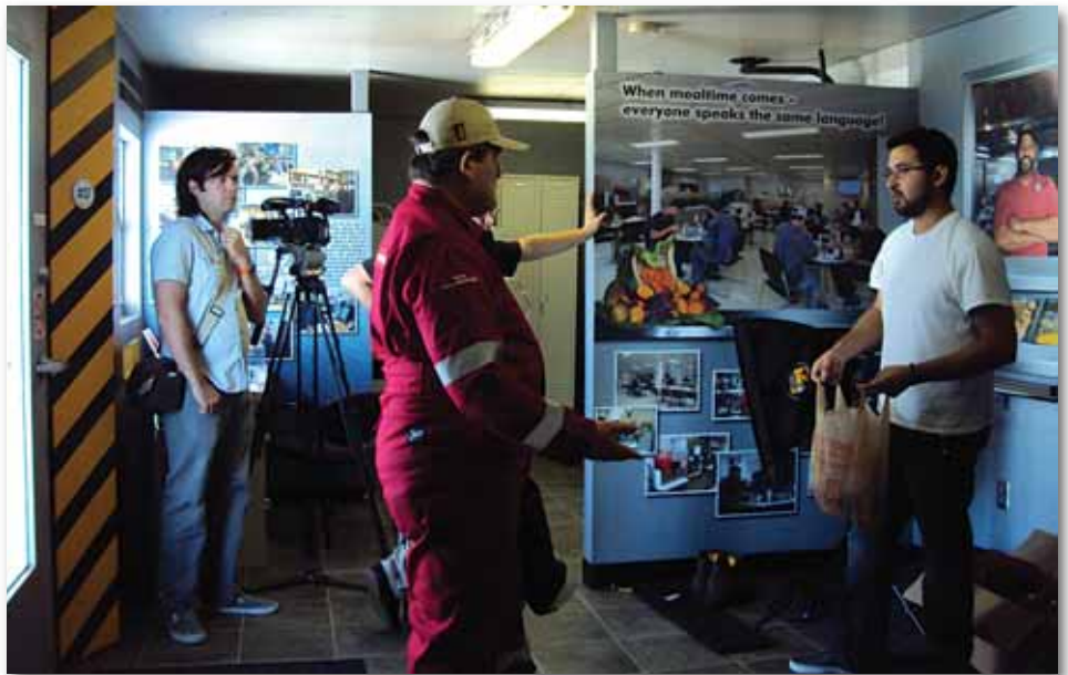
The Ocean Star provides a natural backdrop for industrial footage. PetroEd recently shot portions of a training video for use on their website.

In addition to meeting and event space, the Ocean Star is a popular location for film and photo shoots. The accessibility of the rig museum makes it a natural backdrop for industrial footage. PetroEd and Moduspec recently shot portions of training videos for use on their website, and Bayou City Productions utilized the rig for filming a series of interviews that will be used for a BHP Billiton video.