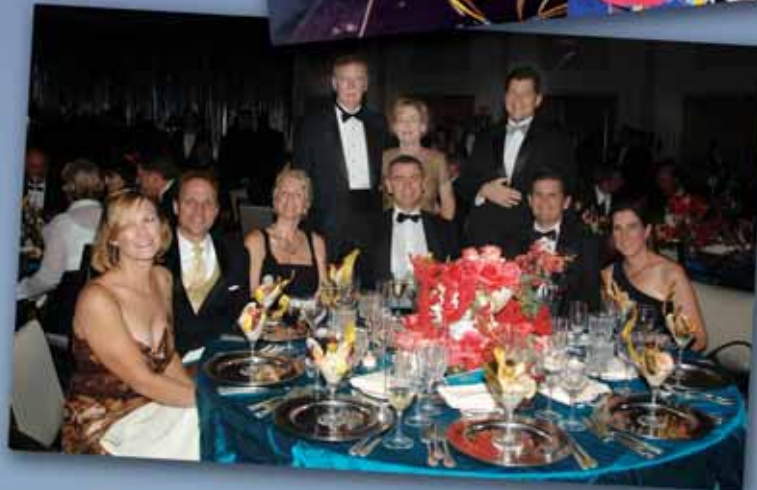
This year's edition of the always popular Ocean Star Gala is set for Sept. 24 at the Westin Galleria Hotel. See details on page 3.

Ocean Star Offshore Drilling Rig and Museum Pier 19 Harborside Drive at 20th Street Galveston Island Tel: 409.766.STAR www.oceanstaroec.com