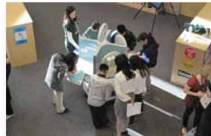
Fourth and fifth grade students at Ridgcrest Elementary school in Amarillo rotate through the MOLU during one of the visits sponsored by the Foundation for Energy Education.

Halliburton sponsored eight visits to schools in the Rio Grande Valley, and Pride International provided six visits in the Houston, Spring Branch, Katy and Barbers Hill school districts.